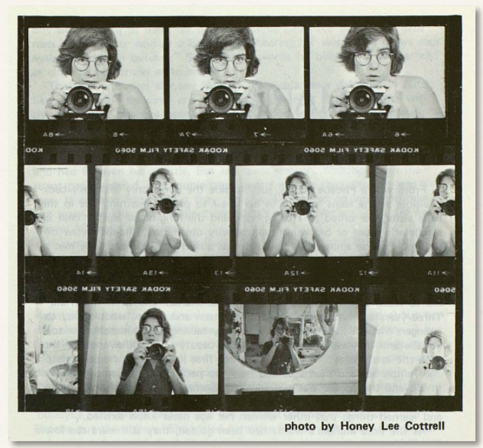
Photographs in a mirror by Honey Lee Cottrell featured throughout Sinister Wisdom 7 . This selection is on page 33.

Sinister Wisdom 7 features a photoshoot by Cottrell (1946-2015) photographing herself in all the mirrors in her house. These photos challenge the reader, asking them to reflect on the subjective nature of images.