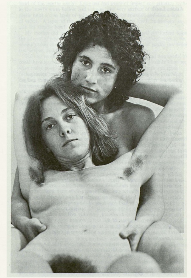
featured in Sinister Wisdom 8 on page 53.